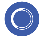
Processing Less DB and better flow