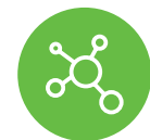
Bonding Prevents Delamination