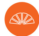
Versatility Oriented and nonoriented