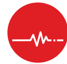
Activity Better Antifog activity