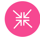
Concentration Lower Antifog loading