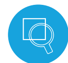
Transparent Excellent optics